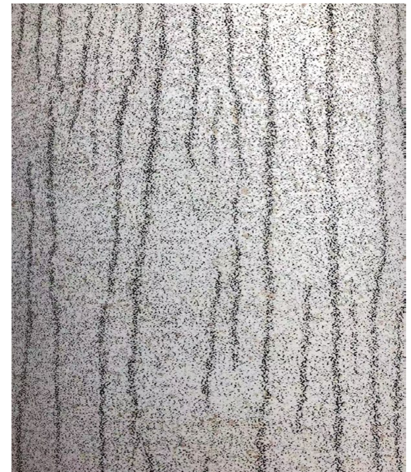
NUI-4, White strings on black cloth, 192x138cm (part), 1987

Uemae died of old age on April 16, 2018.